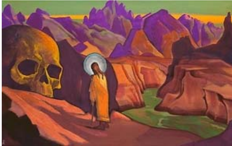
Issa and the Skull of the Giant by Nicholas Roerich

3. The Mother of the World. The Teaching