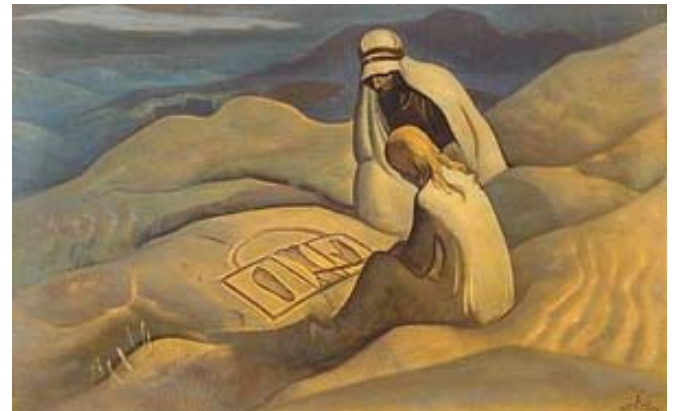
Signs of Christ by Nicholas Roerich

Aries (Easter) through Taurus (Wesak) and the Festival of Gemini (the Festival of the Christ) is the time of rebirth of the Christ Principle in our heart.